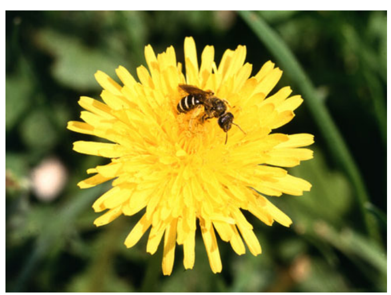
Figure 3. Young dandelion flowers are used to make Biodynamic Preparation 506.